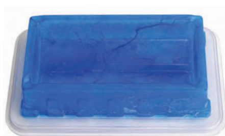
100mL Reagent Reservoir Cooler