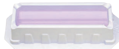
25mL Reagent Reservoir