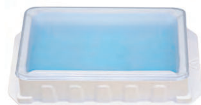
100mL Reagent Reservoir with Lid