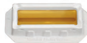
10mL Reagent Reservoir