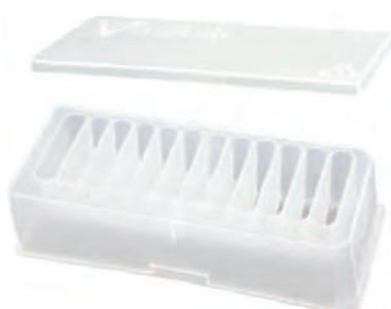
12 Channel Reservoir with Lid (Autoclavable)