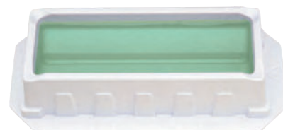
50mL Reagent Reservoir