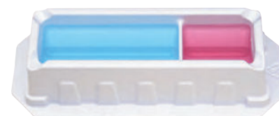
25mL Divided Reagent Reservoir