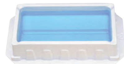
100mL Reagent Reservoir