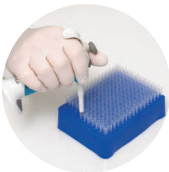
Easy tip acquisition EVERY TIME