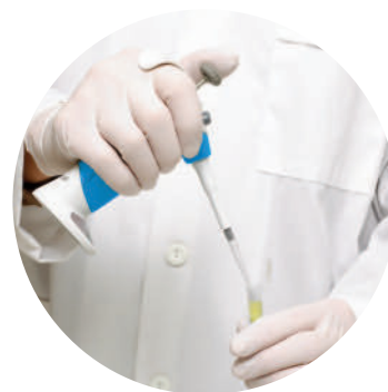
Ergonomically-correct posture that ensures pipetting comfort