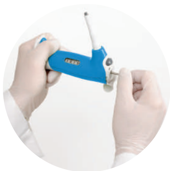
Simple conventional volume setting